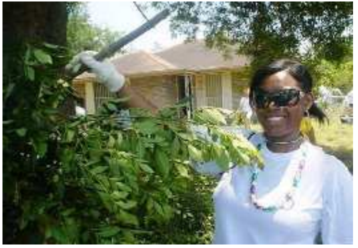
Angelica during the 2008 International Conference Service Event